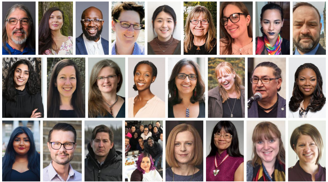
25 of the presenters from our Seeking Justice Together Conference held May 17-20, 2021.

Moving forward, CPJ staff are committed to applying an intersectional lens in our policy research and centering the voices of people most affected by these policy decisions. We do so noting that these are the people and communities who are typically excluded from decision-making processes. We are so grateful to each of the brilliant speakers who participated in the Seeking Justice Together Conference and lent their voices and expertise to illuminate various issues of injustice that will serve to deepen and strengthen our work and impact. With your support, we hope to increase our capacity to understand how individuals' and communities' lived experiences of systemic oppression can exacerbate their experiences of precarity, displacement, and environmental degradation, and to develop strategies to correct these injustices.